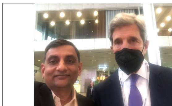
With Mr. John Kerry, the first United States special presidential envoy for climate